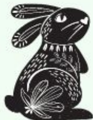
The Jade Rabbit

In children's literature, anthropomorphism allows for the utilization of complimentary traditional folklore to highlight its own cultural significance for those children previously unexposed.