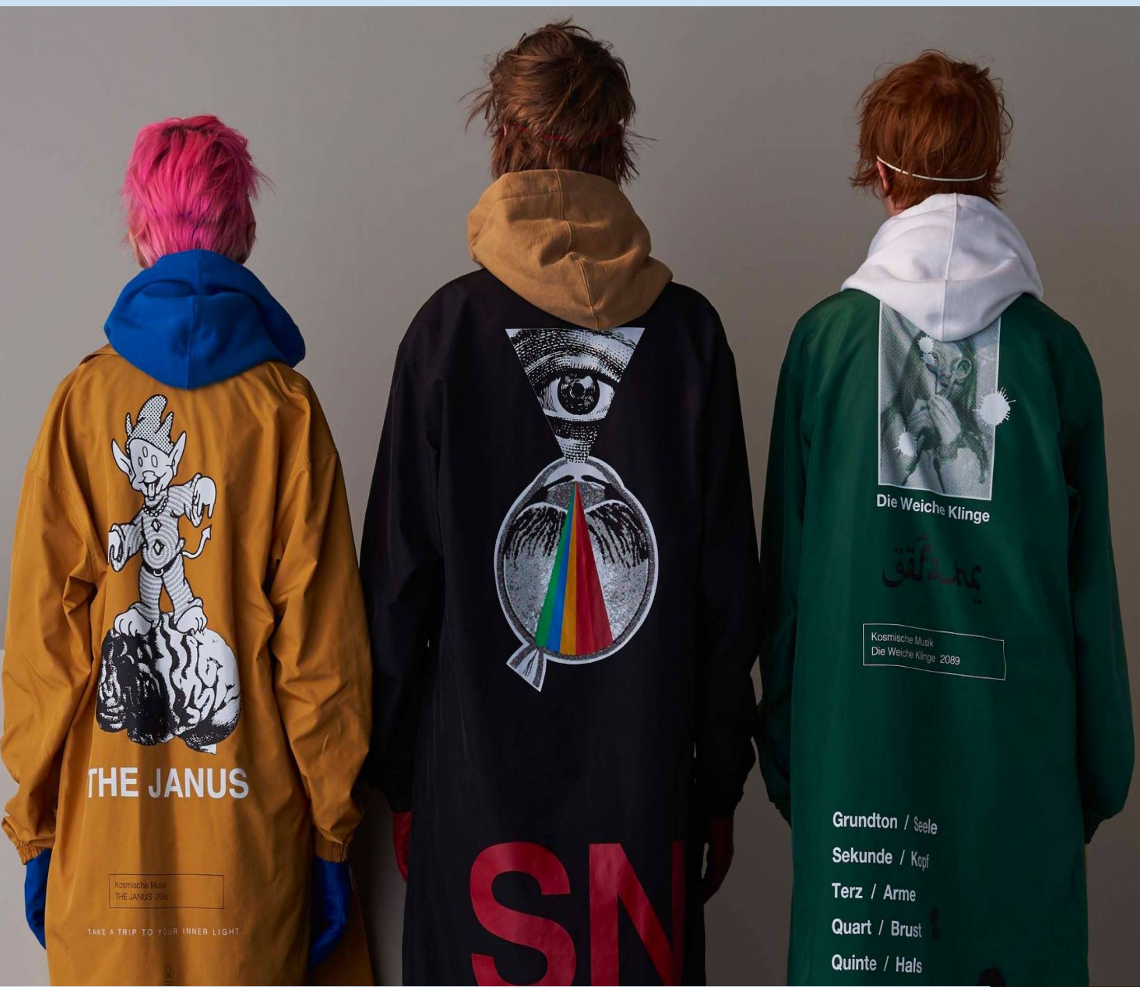
Jun Takahashi's Japanese streetwear brand, Underground