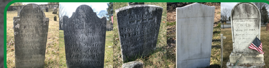
Fig 3. Photographs of the five main shapes found in the cemeteries.