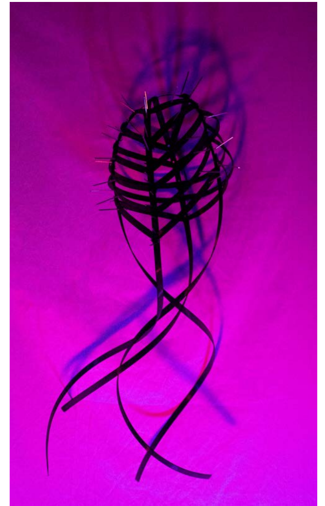
“Suspended Hellion II”

Materials: Polyester corset boning, nails, and thread.