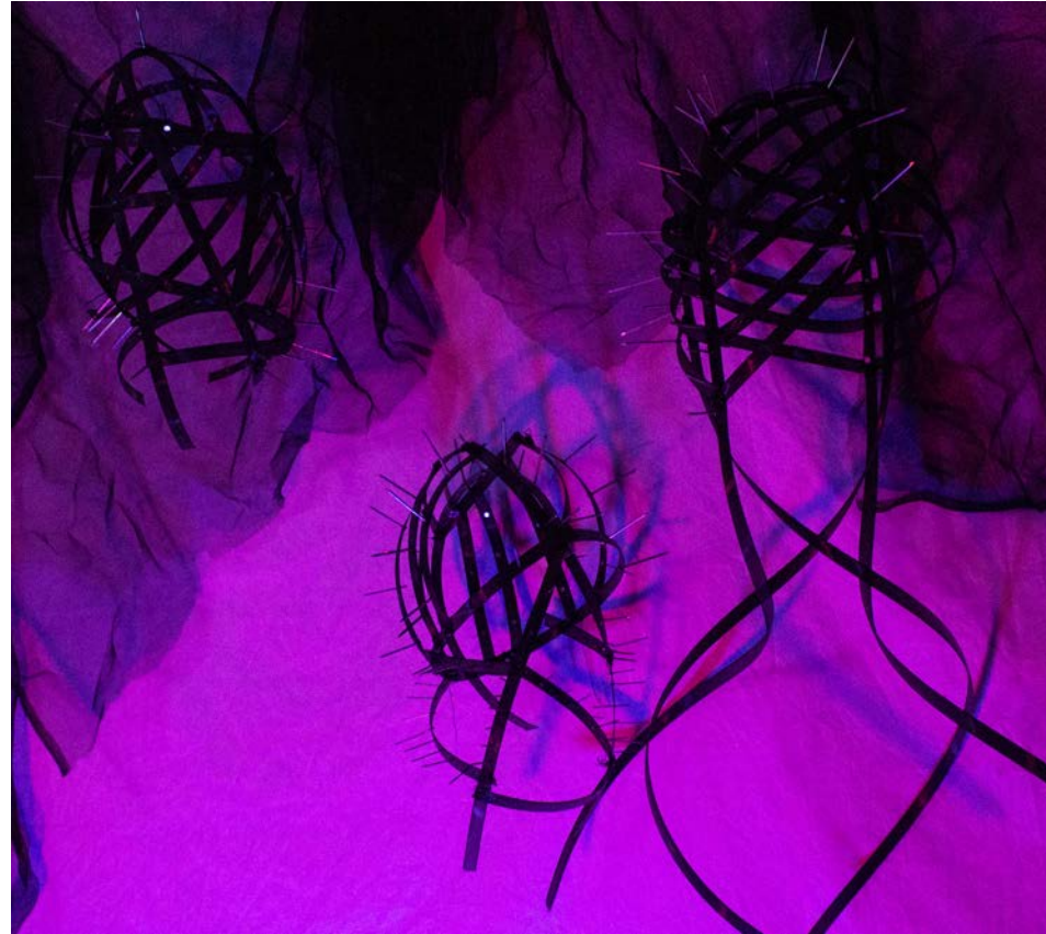
“Danger Ensemble II”

Materials: Polyester corset boning, nails, and thread.