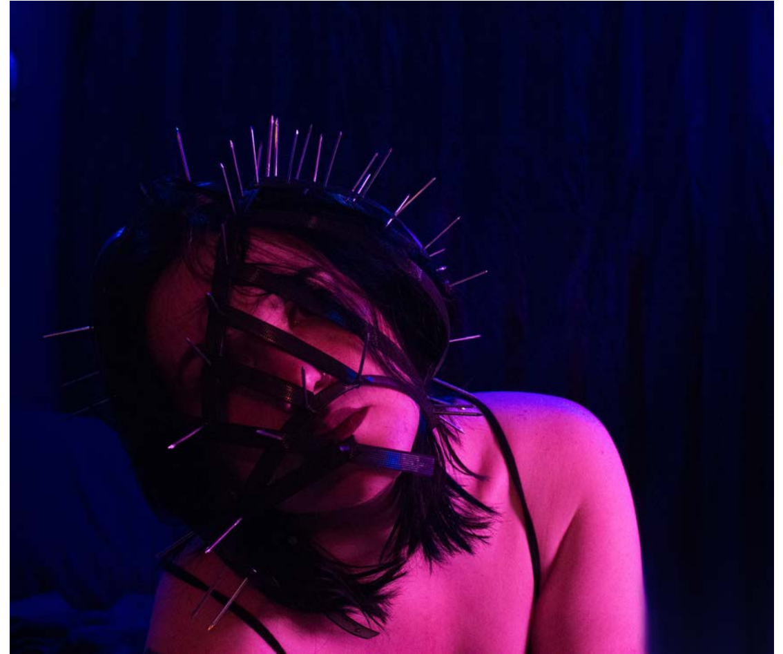
“ Scold’s Bridle II”